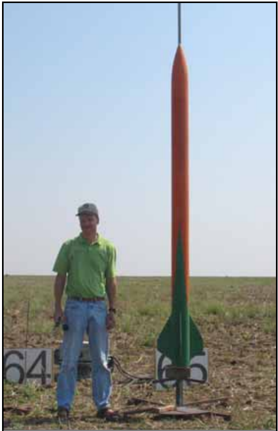
Steve Klausmeyer's GO! Rocket - Level 3 certification project is ready to fly on an M1297.