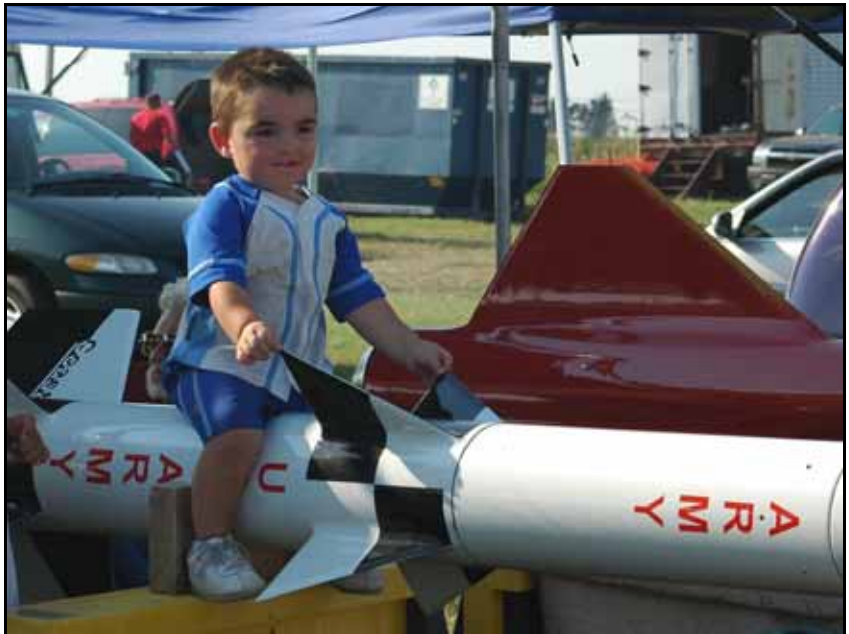
A future astronaut practices for his first trip into the heavens aboard Keebler Wilkins Nike Zeus. Better get this young fellow a seat belt, though.

KLOUDBusters has hosted LDRS 4 times at our Argonia, Kansas launch site – 1993 , 1994 , 1999 & 2003 .