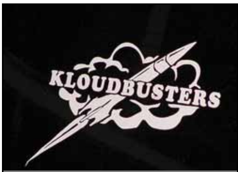
KLOUDBusters logo decal displayed proudly on the back window of Lance Lickteig's Rocket Van.

Would you like to display your KLOUDBusters pride on your vehicle, on a rocket, on your range box /toolbox, or anywhere you choose for that matter? There are two options available: a decal or a sticker. "What's the difference?" you might ask. Well, the decal transfers only the KLOUDBusters "Rocket through